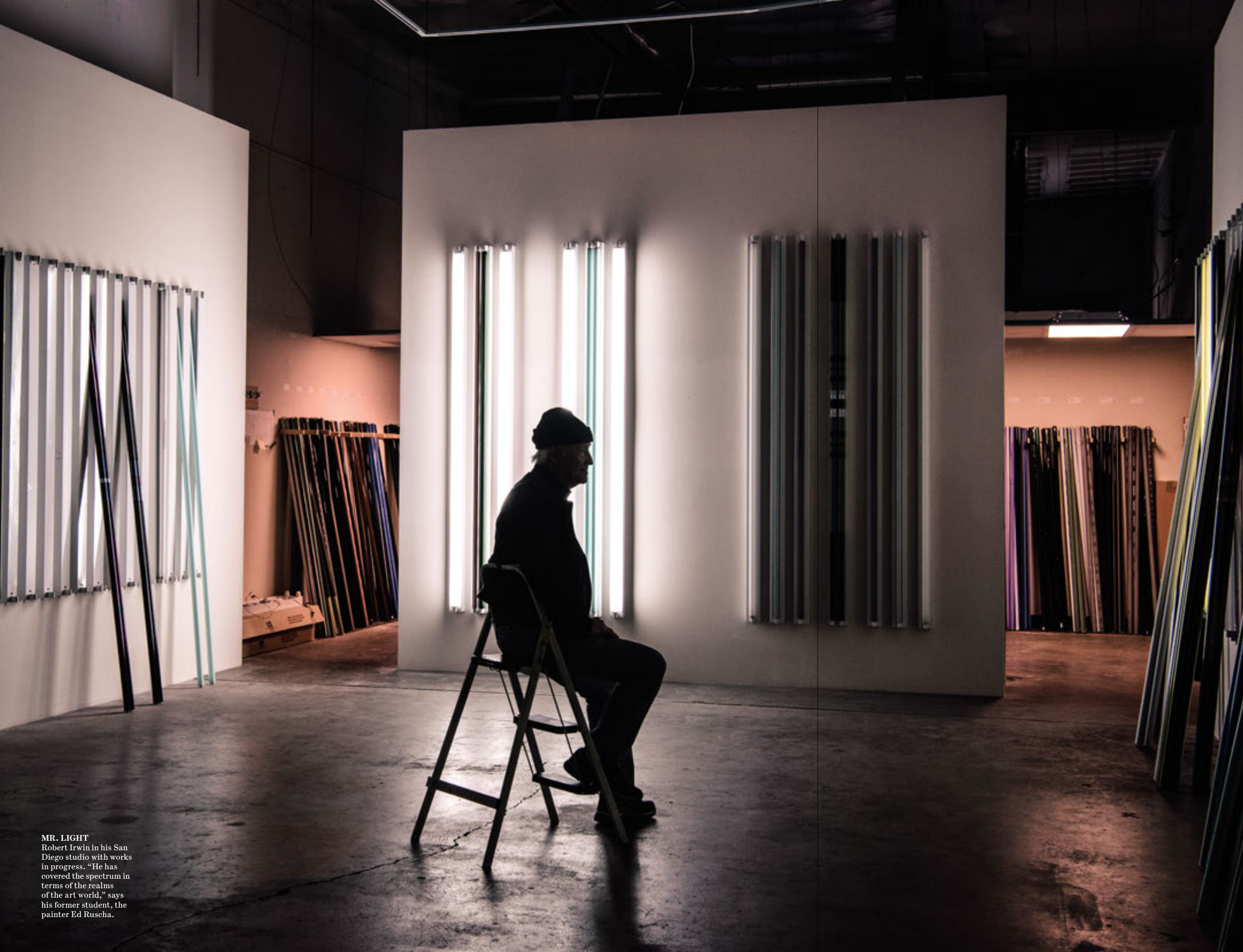
MR. LIGHT Robert Irwin in his San Diego studio with works in progress. "He has covered the spectrum in terms of the realms of the art world," says his former student, the painter Ed Ruscha.