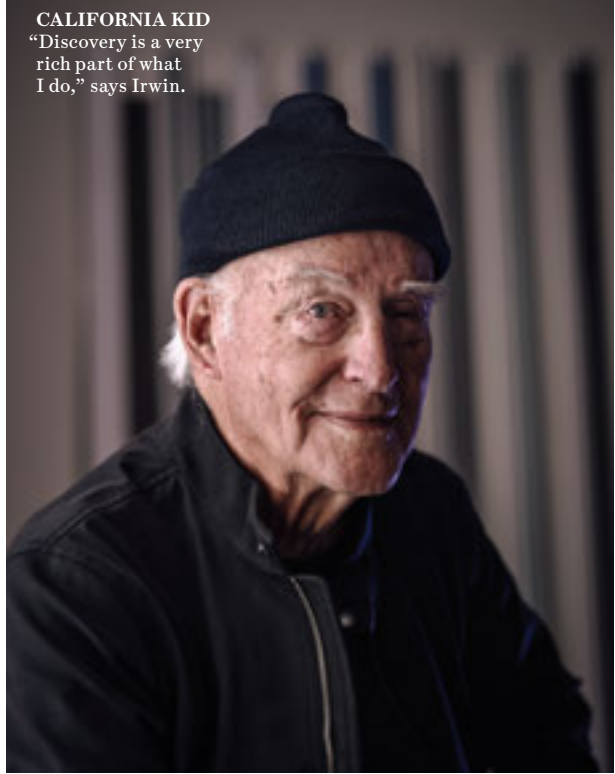
CALIFORNIA KID “Discovery is a very rich part of what I do,” says Irwin.

Throughout his career, Irwin has been considered a pioneer of '60s and '70s Southern California movements, like Light and Space, which extended minimalism to phenomenology, and Finish Fetish, which involved high-tech materials and super-gloss, hot-rod-like surfaces. “Bob has gone in his own direction, into the world of perception,” says artist Ed Ruscha, who studied watercolor painting with Irwin in the late '50s at L.A.’s Chouinard Art Institute. “He has covered the spectrum in terms of the realms of the art world.” (Irwin is also the first visual artist to have won a John D. and Catherine T. MacArthur Foundation “genius” grant, in 1984—an honor he shares with fellow Light and Space luminary James Turrell, who won it the same year.)