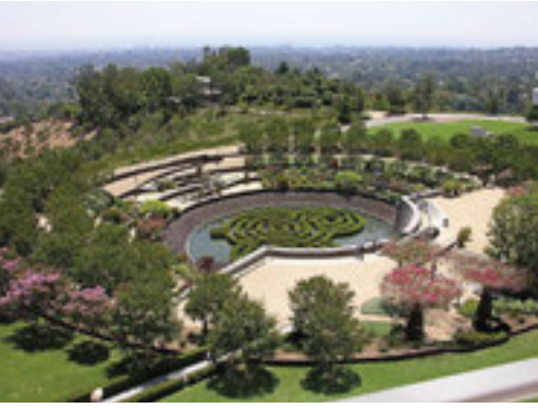
SPIRAL GETTY Above: Irwin’s Central Garden at L.A.’s Getty Museum. Top: 2015’s Excursus: Homage to the Square 2 , at Dia: Beacon, which was designed by Irwin.